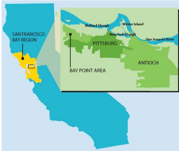
Project area shown in map above and in detail map at right.